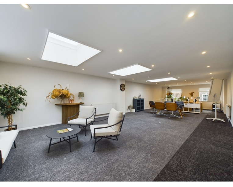
25 High Street, High Wycombe, Buckinghamshire, HP11 2AG