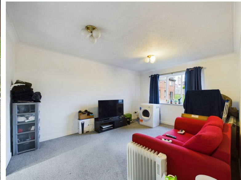
Sovereign Court, Totteridge Avenue, High Wycombe, Buckinghamshire, HP13 6XL