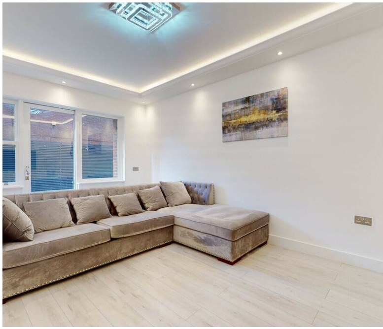
Unique 2 Bedroom Apartment with private Terrace to Rent in Kingston House South, Ennismore Gardens, Knightsbridge, London SW7.