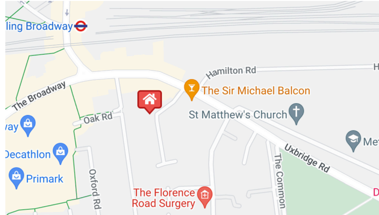
Illustration for identification purposes only. Not to scale.

Northcote Avenue, W5 Approximate Gross Internal Area 82.43 SQ.M / 887 SQ.FT (EXCLUDING OUTSIDE STORAGE) OUTSIDE STORAGE: 1.04 SQ.M / 11 SQ.FT INCLUSIVE TOTAL AREA 83.47 SQ.M / 898 SQ.FT