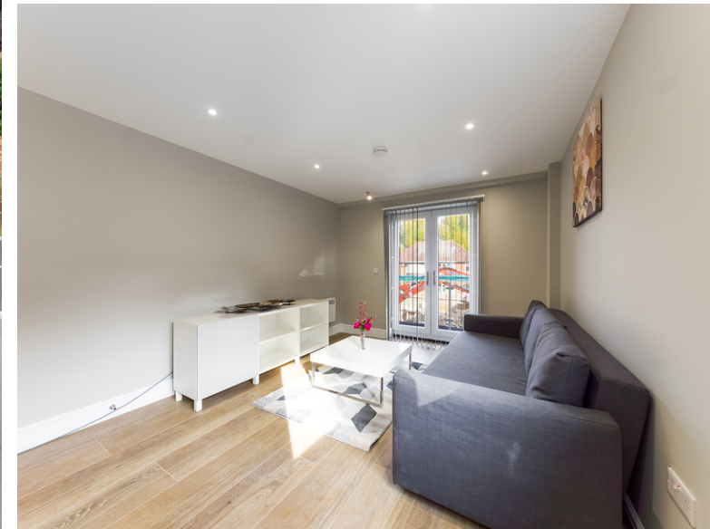
Flat 6 Sekhon House Kingsmead Road, High Wycombe, HP11 1UZ