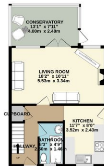
GROUND FLOOR 709 sq.ft. (65.5 sq.m.) approx.