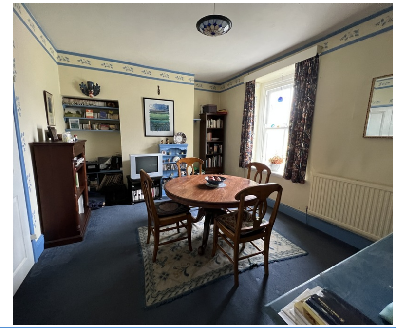
Arwel, 8 Trinity Place, Aberystwyth, SY23 1LT

A freehold end-terraced Victorian style 5 bedroom town house with 2 reception rooms, kitchen/dining room, rear garden and single garage provision. The property is situated close to the town centre in Aberystwyth which offers excellent educational, social and shopping facilities with public transport to all parts. The property lies in mainly residential area within level walking distance to the main shops. The house was built c1880s of traditional masonry stone walls which supports a pitched roof laid with slate. The main walls are rendered and painted. Windows are of replacement type timber casement sashes with double glazed inserts, Velux windows within the roof slopes of the top floor.