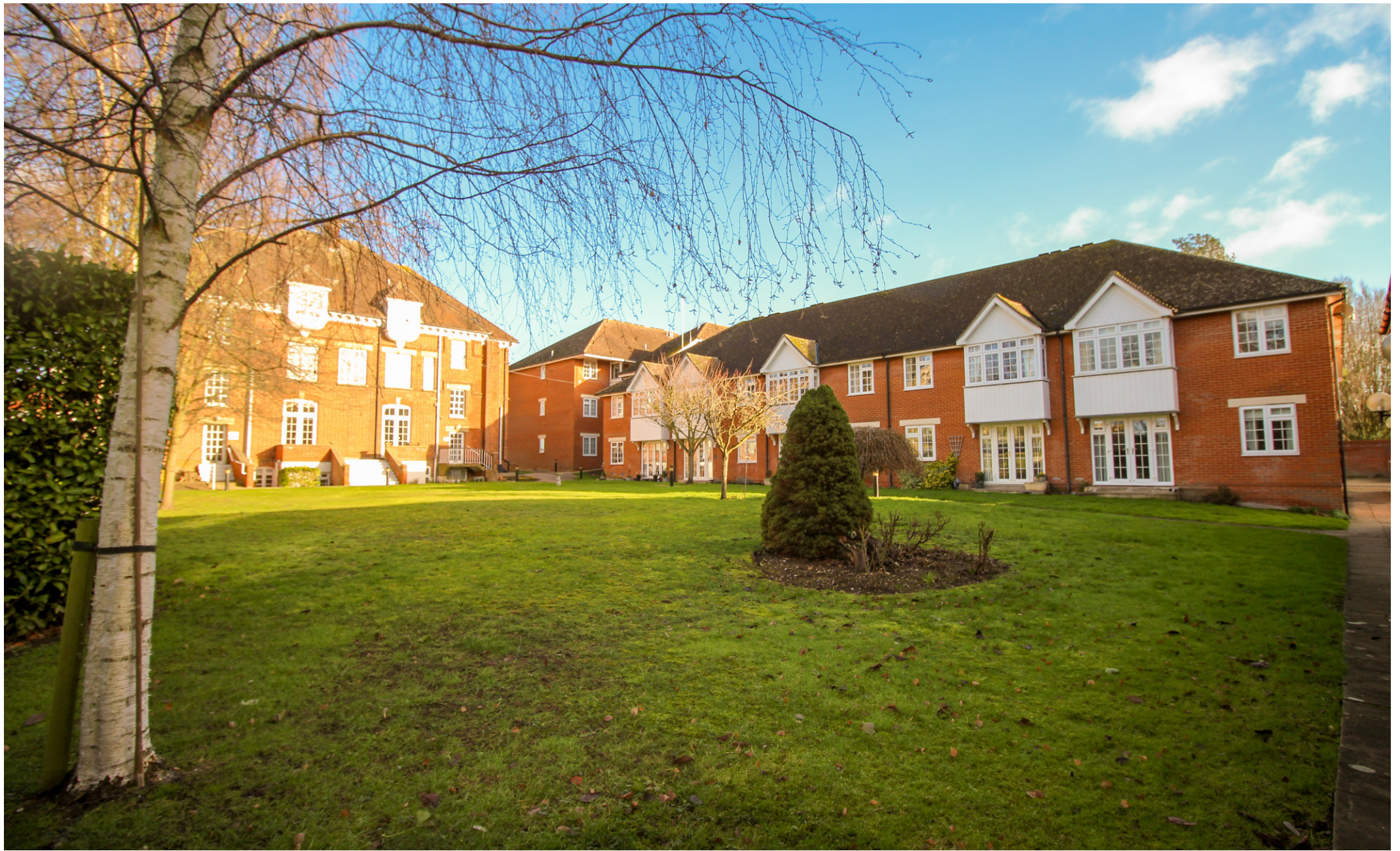
Hillside, Heath Road. Newmarket