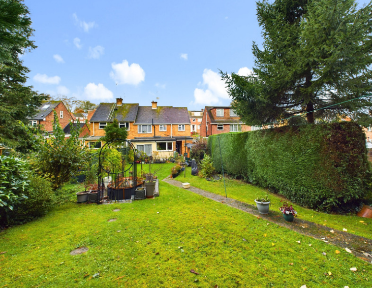
77 Marys Mead, Hazlemere, High Wycombe, Buckinghamshire, HP15 7DS