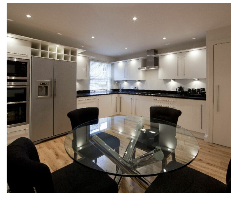
Fully Furnished 1 Bedroom Apartment to Rent in Mayfair, London W1.