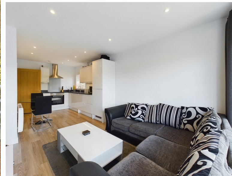
Flat 1 Jem House, Grove Gardens, High Wycombe, HP13 7JG