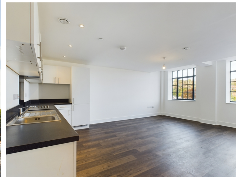
2nd Floor, Birch House, The Old Works, Leigh Street, High Wycombe, HP11 2WP