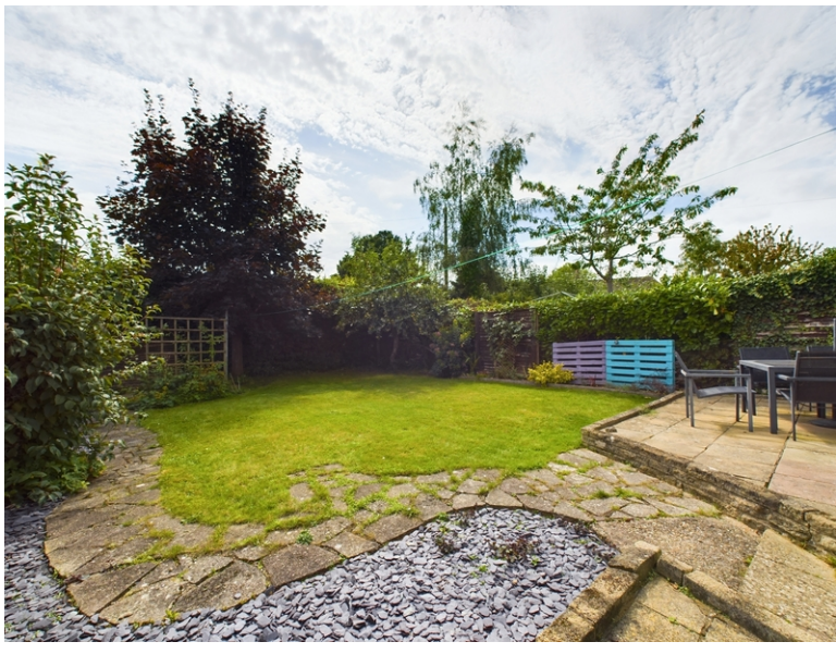
Beech Tree Road, Holmer Green, High Wycombe, Buckinghamshire, HP15 6UZ