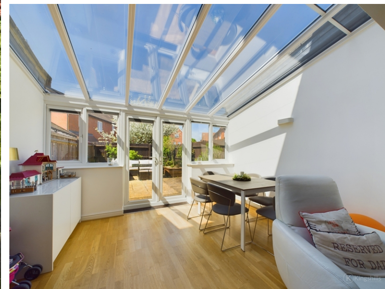
37 Kingshill Crescent, High Wycombe, Buckinghamshire, HP13 5NF