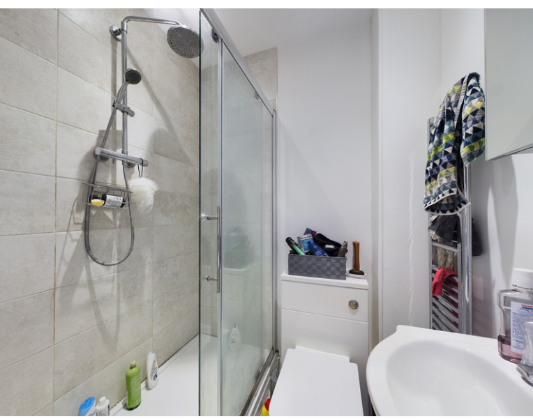
Sumner House Mendy Street, High Wycombe, HP11 2FF